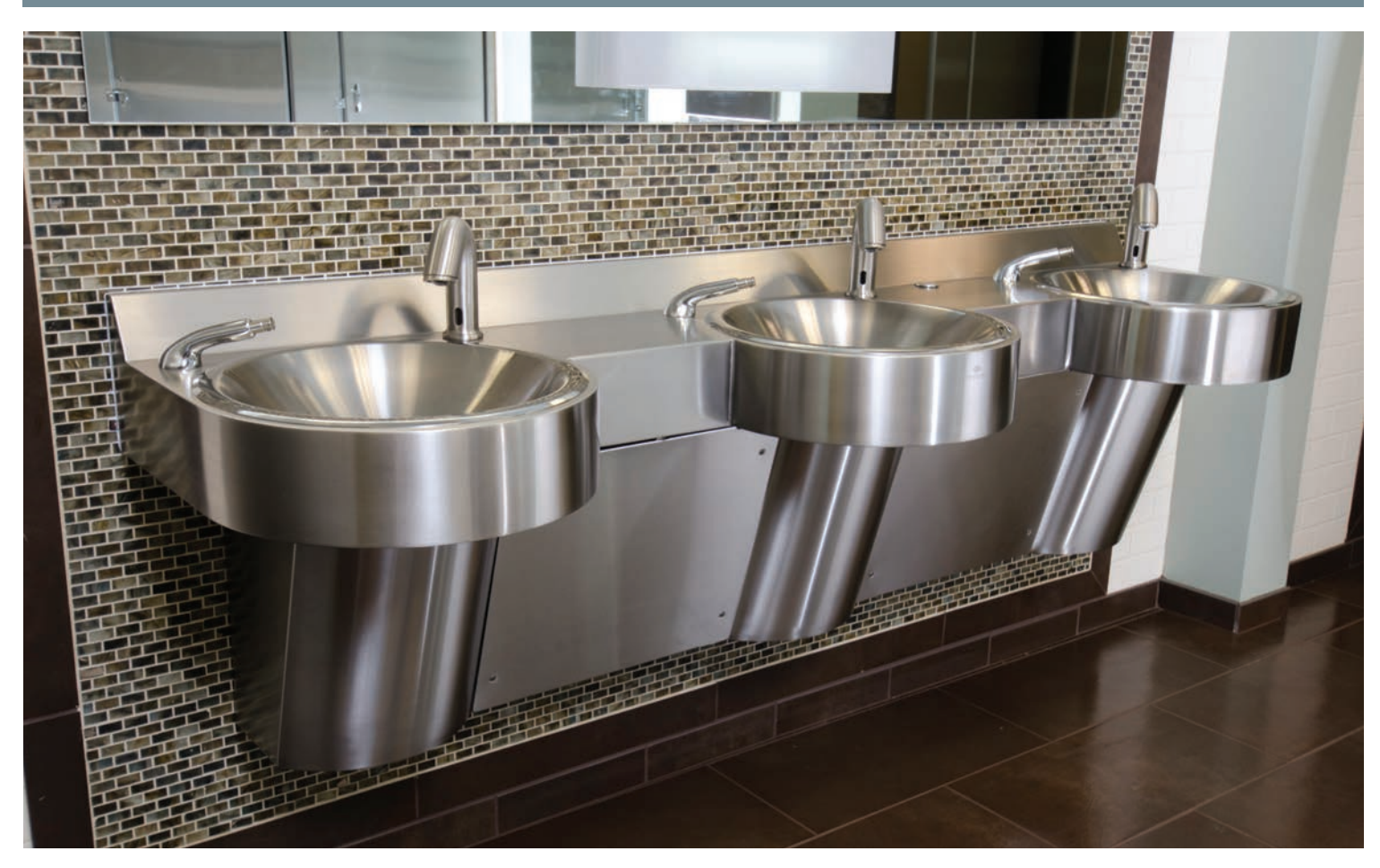
Precision Engineered Washroom Systems. Model #3703-1-DMJ-SO-PDM-SES.