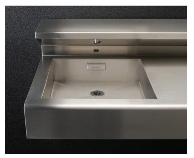
Square Bowl for M3710 Series, specify -SQR option.