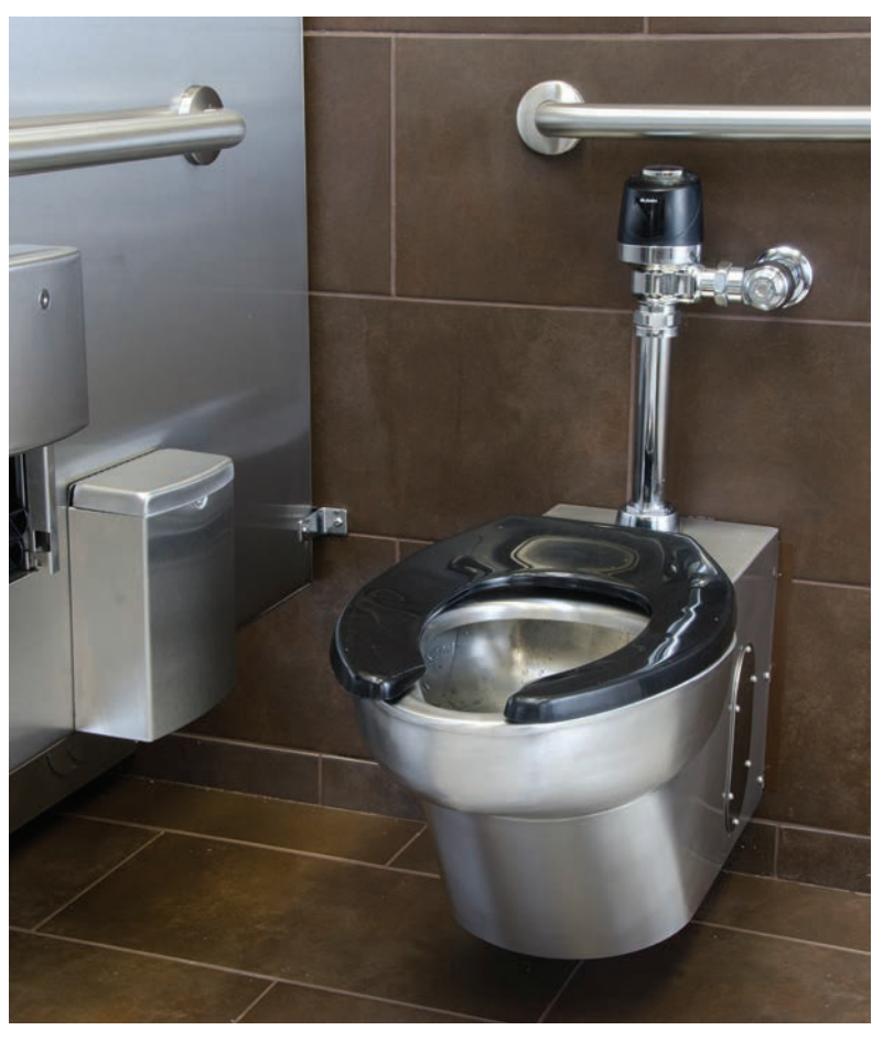
Meridian siphon jet, off-floor, stainless steel toilet with black toilet seat. Model #M2141-T-1-HS-FVBO.