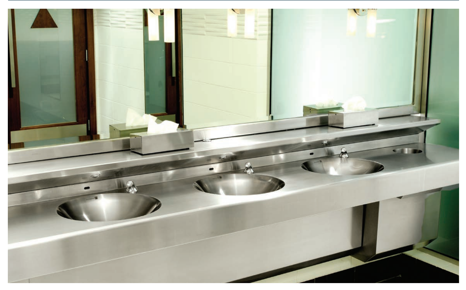
An Attractive Stainless Steel Finish. Model #M3713-IS-RL-PDM-WRR.