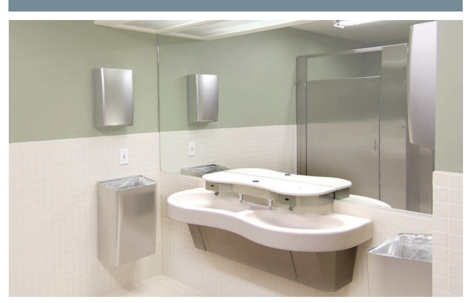
Commercial Design for Everyday Use. Model #3792-1-SO-DV.