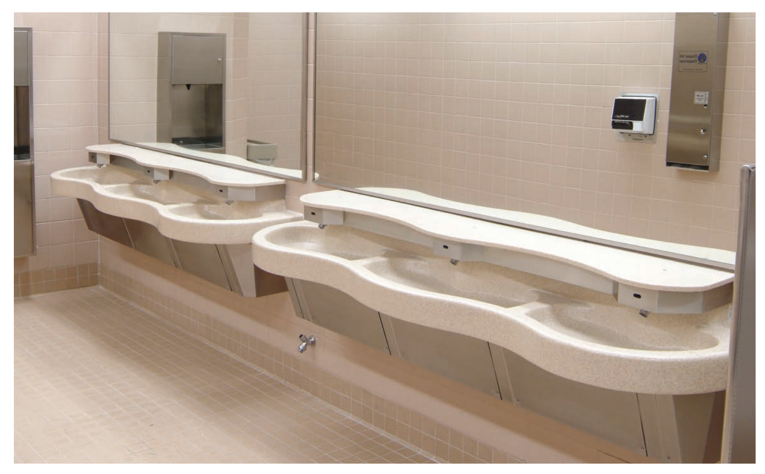
Minimal Assembly for an Easy and Timely Installation. Model #3793-1-SO.