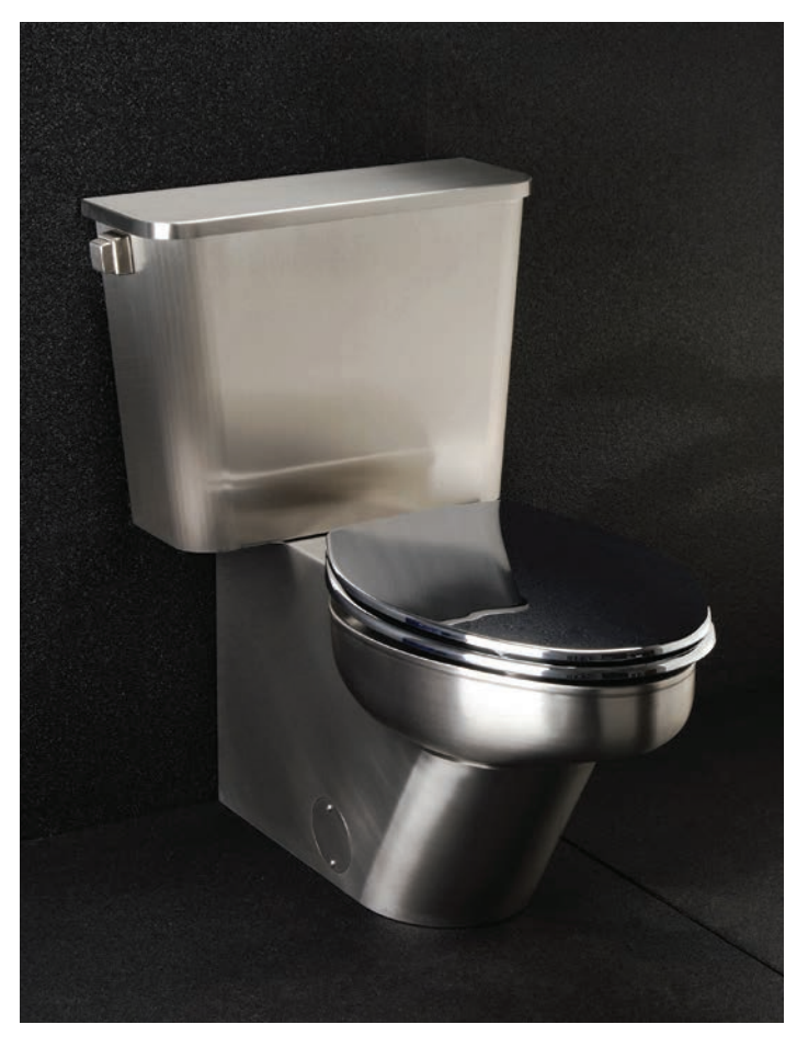
Meridian tank-style toilet, wall inlet and floor outlet, stainless steel with elongated toilet bowl and toilet seat. Model #8950-3, satin finish.