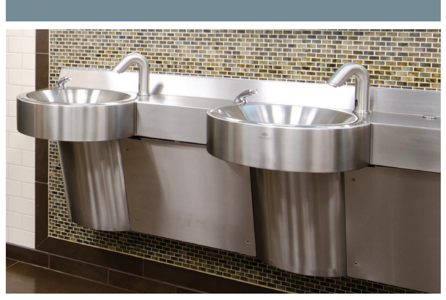
Meridian has a Unique Contemporary Look. Model #3703-1-DMJ-SO-PDM-SES.