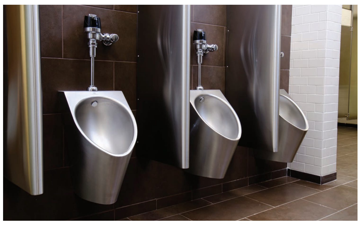
Aesthetic and Vandal-Resistant for Modern Living. Model #2158-T-1-FVBO.