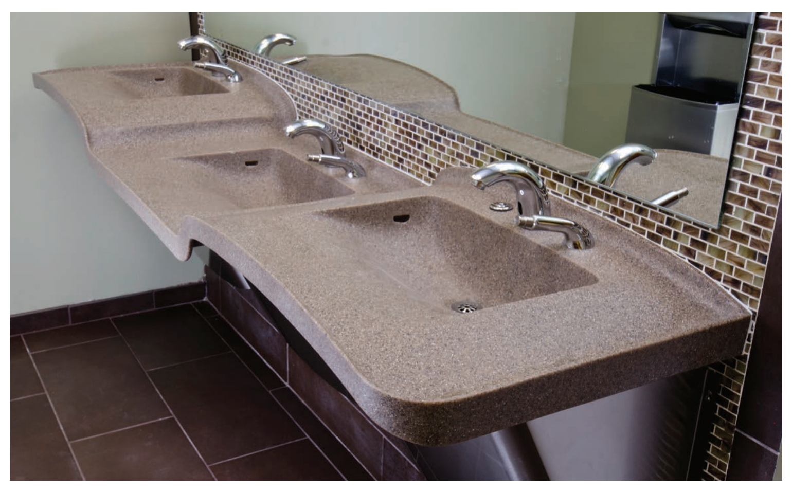
Meridian Corterra Hi-Lo Tri-Basin. Model #3753-1-HLH-SO-PDM.